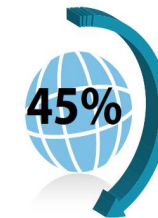
3G population coverage