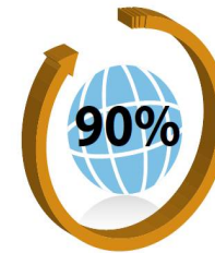
2G population coverage

Next gen converged and global mobile networks